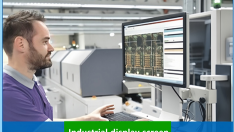
Industrial display screen