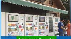
Self-service vending machine