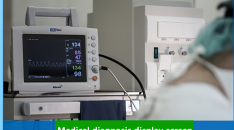
Medical diagnosis display screen